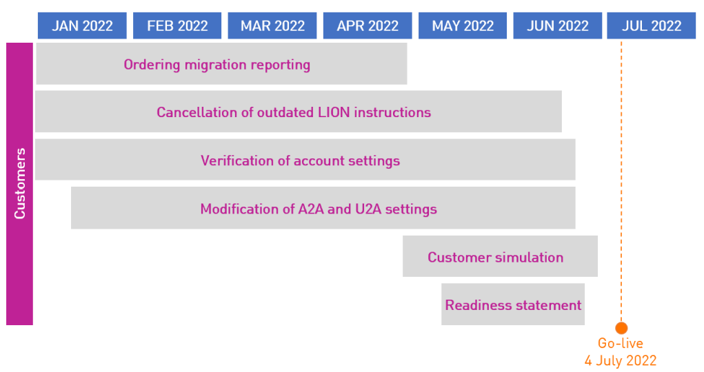
Figure 2: SET-GO CSD Migration (Phase 2) timeline at a glance

The timeline below provides customers being a member of a German stock exchange with an overview of the activities that CBF has planned as part of the SET-GO Customer Readiness. CBF kindly asks customers to consider the activities shown in their planning and to complete them on time. Customer requests that arrive after the end of the timeline shown may not be considered by CBF before the go-live in July 2022.