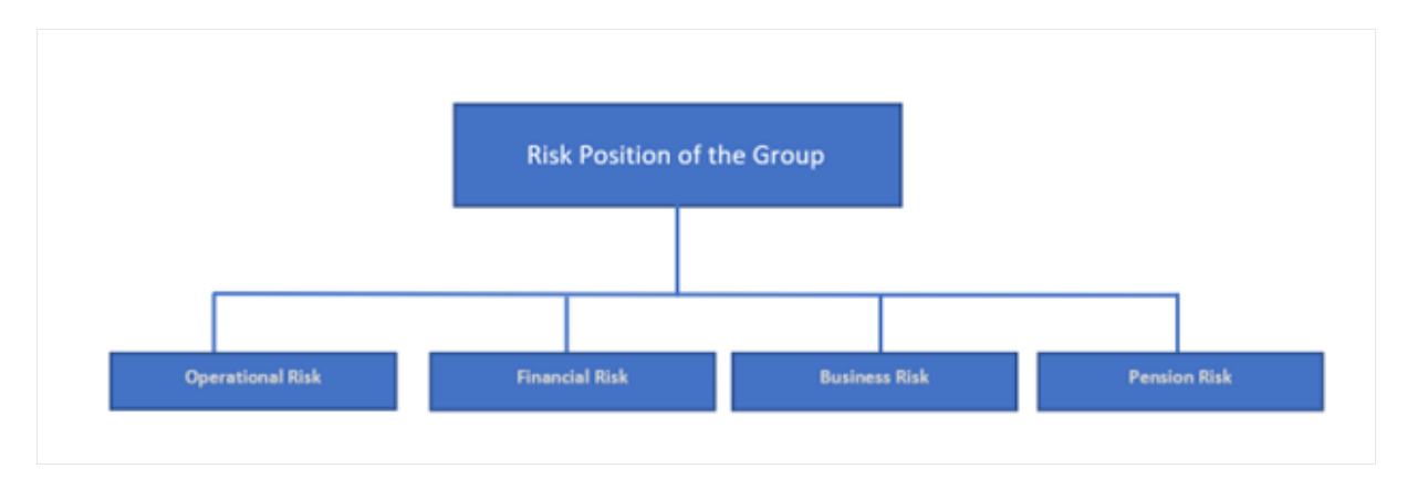
Figure 4: Risk profile of Clearstream

The risk profile of Clearstream differs fundamentally from those of other financial services providers. Operational risk is assessed as major risk type within Clearstream. Business risk is considered material. Regarding, Pension Risk is considered as an immaterial risk in the risk profile, but processes are applied treating it as a material risk type. Financial risk is discussed in subsequent chapters.