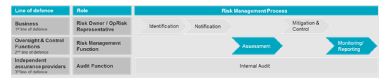
Figure 3: Risk management process

Controlling the risks is performed in the decentralised business areas, that is, where the risks occur. Risk control in the Clearstream operational units is ensured by nominating "Operational Risk Representatives" who are responsible for identifying, notifying and controlling any risk in their area. Clearstream Risk Management, a central function within Clearstream, assesses all existing and potential new risks and reports on a quarterly basis and, if necessary, ad hoc to the relevant Executive Board (see risk management process below).