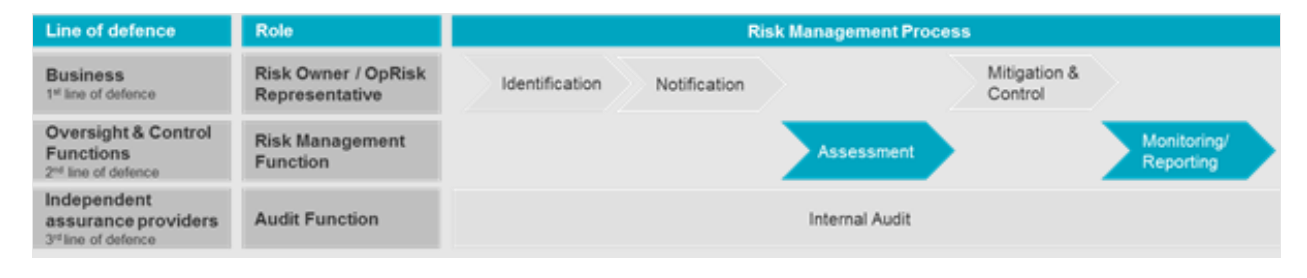
Figure 4: Risk management process

Controlling risks is performed in the decentralised business areas, that is, where the risks occur. Risk control in the Clearstream operational units is ensured by nominating "Operational Risk Representatives" who are responsible for identifying, notifying, and controlling any risk in their area. Clearstream Risk Management, a central risk controlling function within Clearstream, assesses all existing and potential new risks and reports on a quarterly basis, and if necessary ad hoc, to the relevant Executive Board.